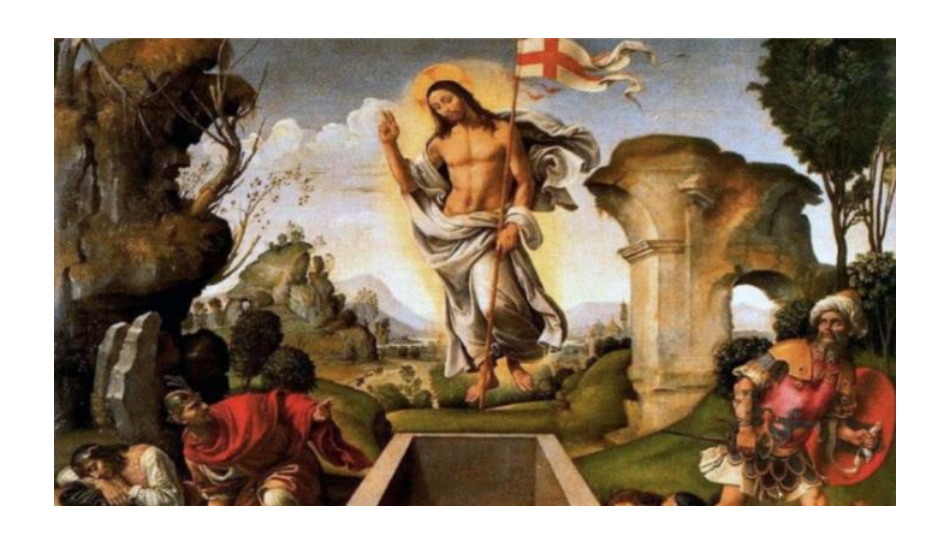
Christ, our hope, is truly risen! Alleluia!