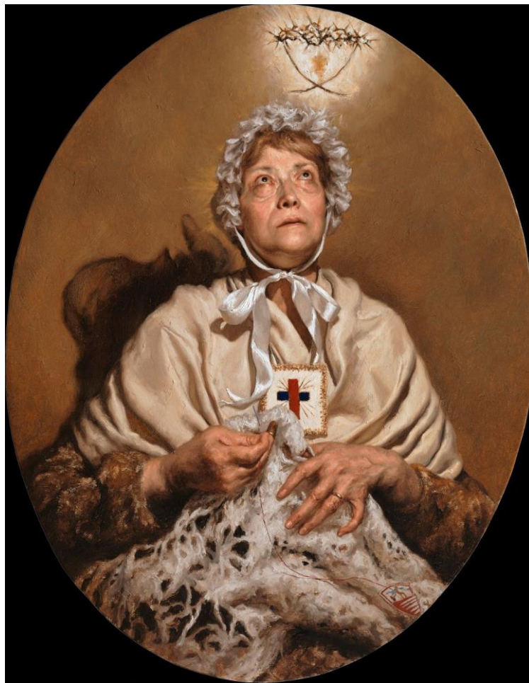
Blessed Anna Maria Taigi.