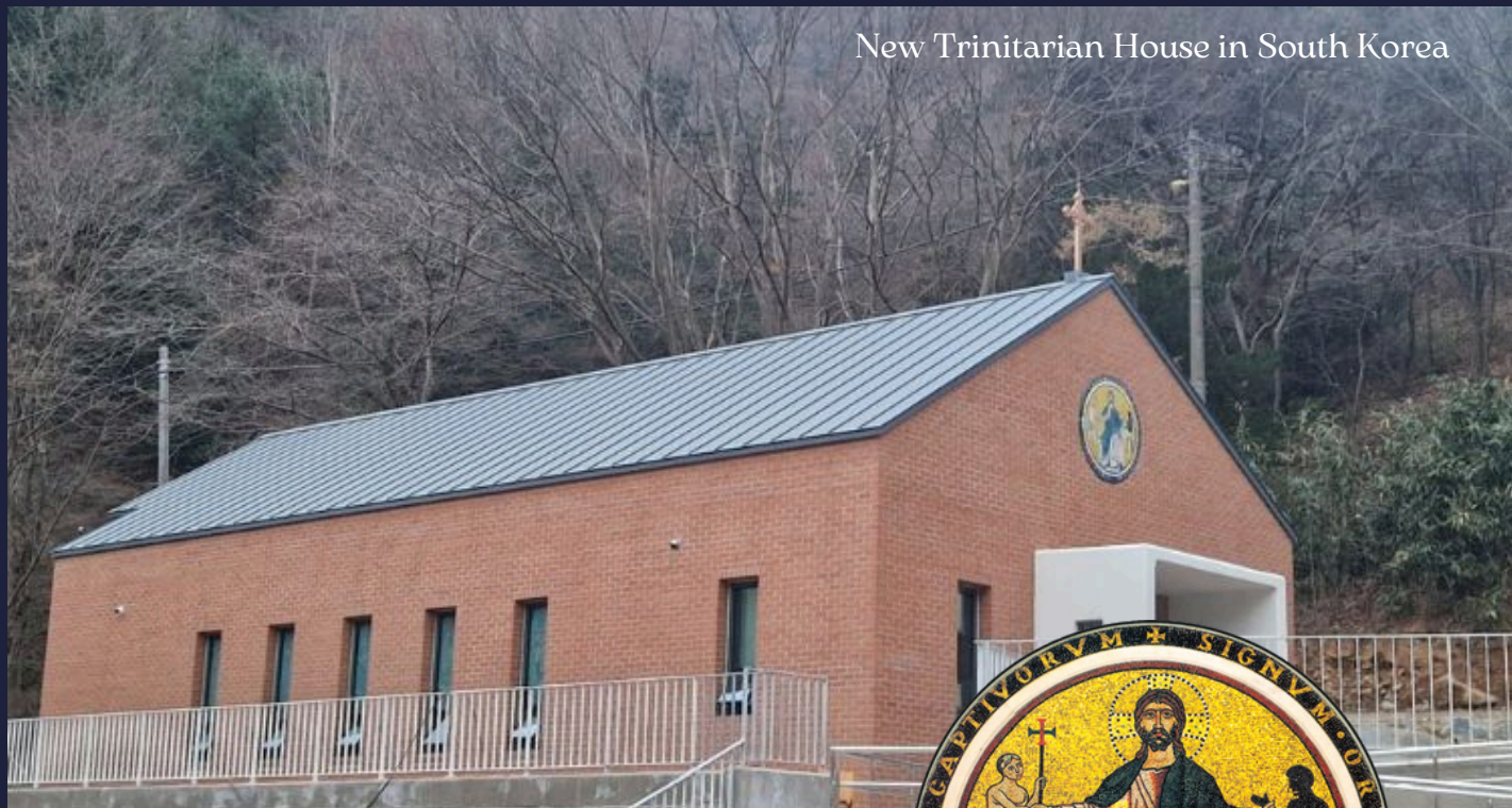
New Trinitarian House in South Korea