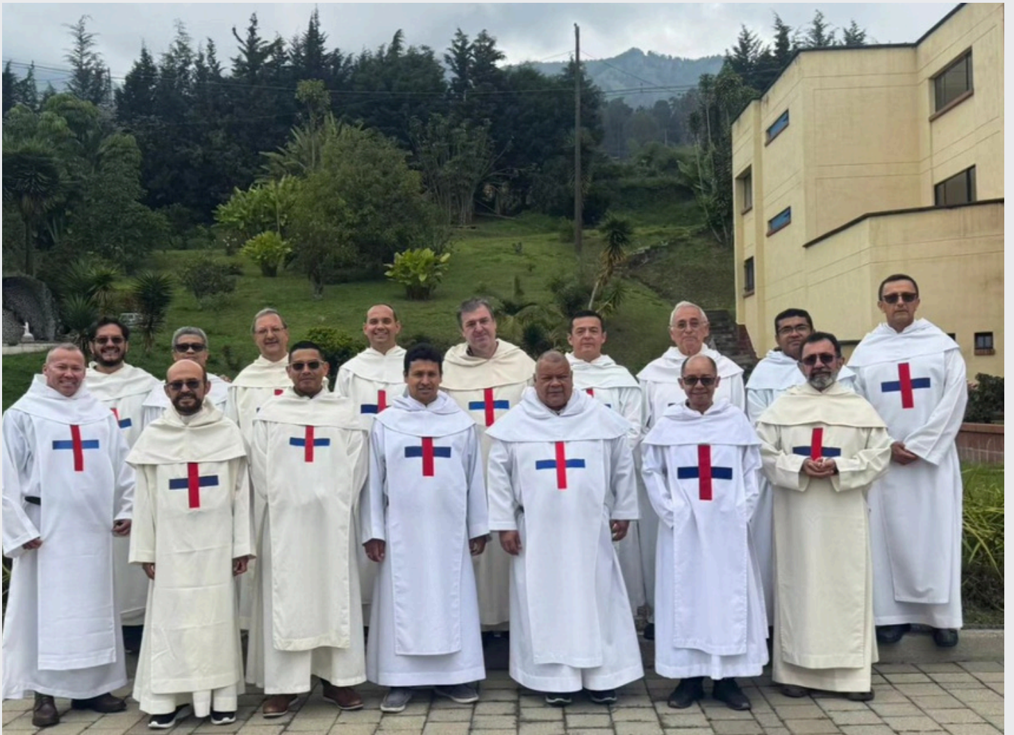
Lyon-France: Perpetual Profession